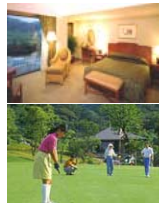
World Council Hotel Venue Ta Shee Resort 166, Jin-Shin Road, Ta Shee, Taoyuan, Taiwan.

The Health Club provides a wide variation of health equipment and expert attendants are prepared for the health enthusiast like you. For those who like "ball" sport, they have the multi-function air-filled in-door center with badminton courts . There are also international standard our-door tennis courts. In addition, the outdoor swimming pool provides an enjoyable place to relax in the fresh air.