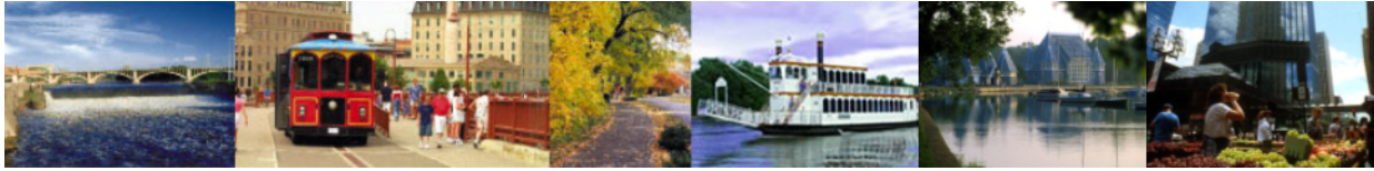
Minneapolis © 2006 GMCVA and Image © Minnesota Office of Tourism