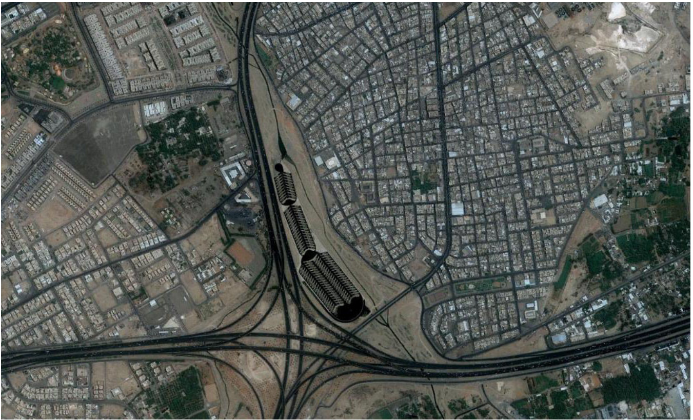
Aerial View of the bio-remediation facility.

This project is already successful in providing water treatment while creating a one-of-a-kind natural facility and open-space public attraction.