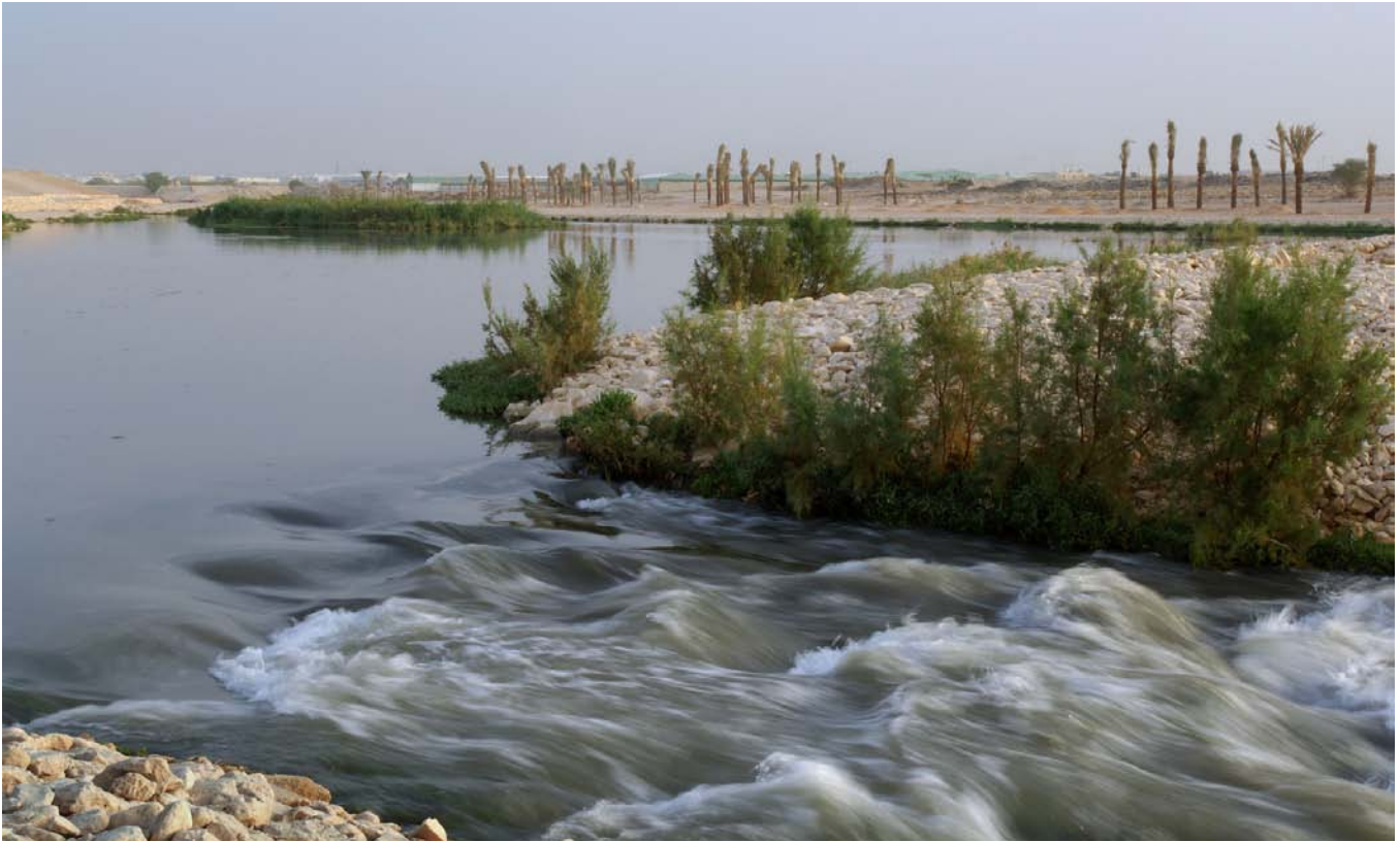
Introduction of landscaping to re-establish natural vegetation in the Wadi bed.