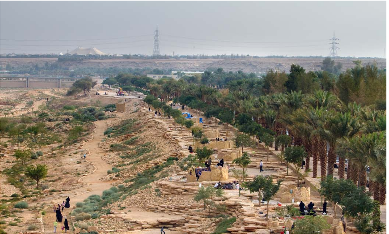
Open spaces and parklands along the Wadi.