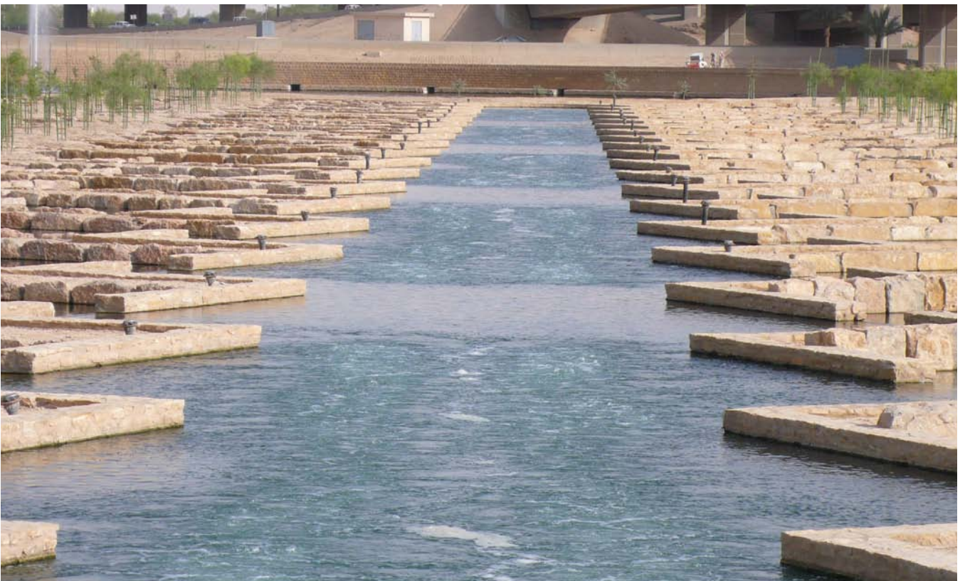
The Bio-remediation Facility is one of the most impressive features of the project.