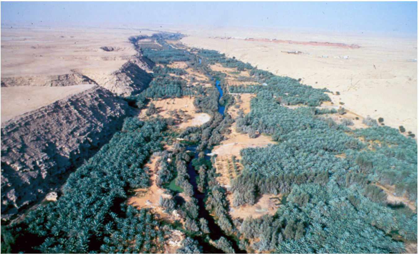
Aerial view of the Wadi Hanifa, 2007.