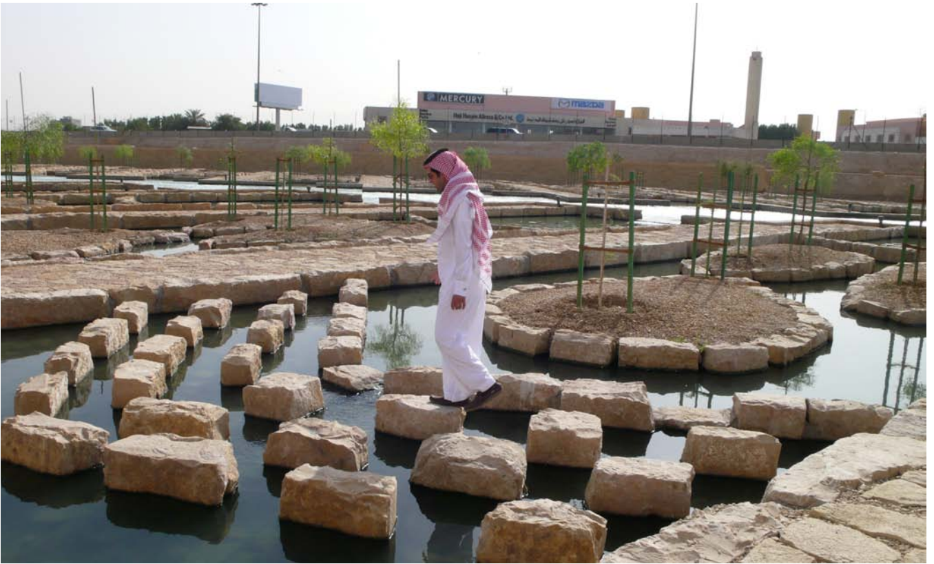
The Bio-remediation Facility is all built with natural materials.