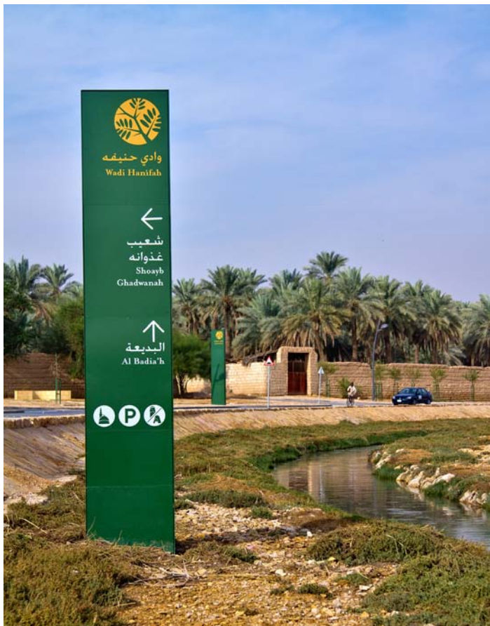
Interpretative trails that wind their way throughout the Wadi allowing the public to access the area easily and to direct them to places of interest.