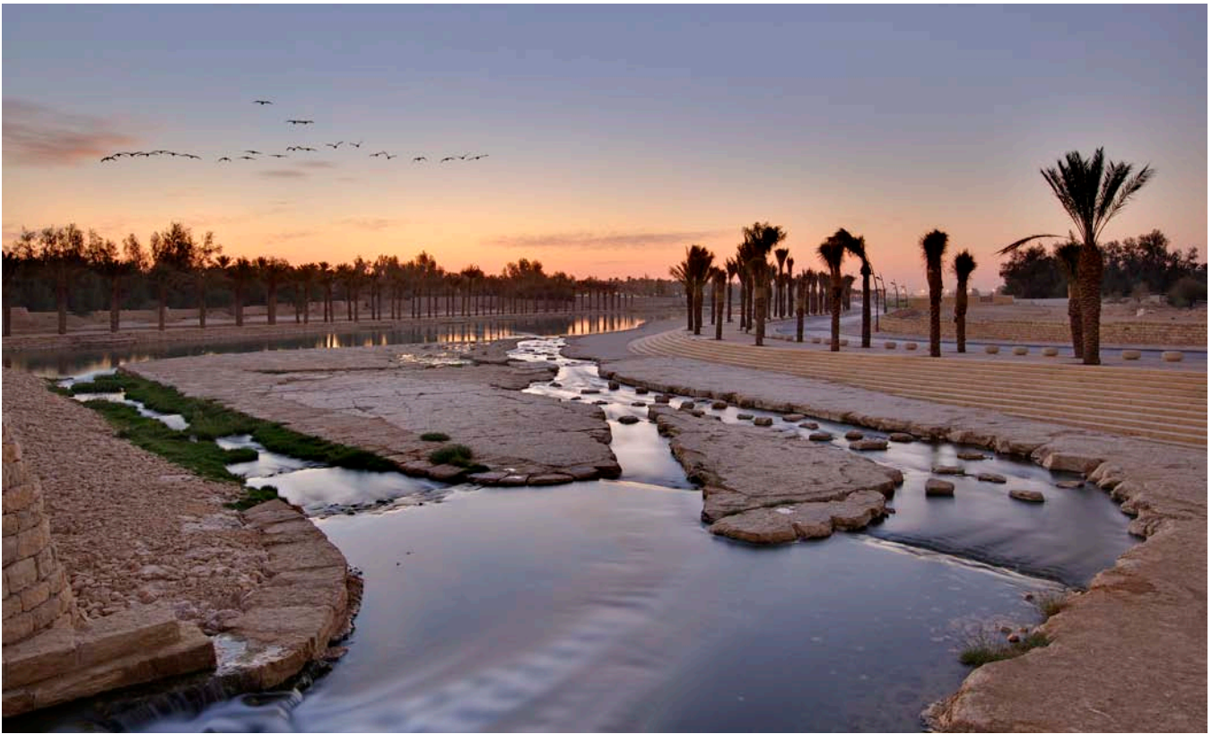
Re-establishing the natural landscape in the desert tablelands and rangelands of the desert catchment area above the Wadi bed, including construction of check dams.

The parks are designed in a way that provides family compartments, in the form of semienclosed areas, that each family can use for the day, without being disturbed by neighboring families.