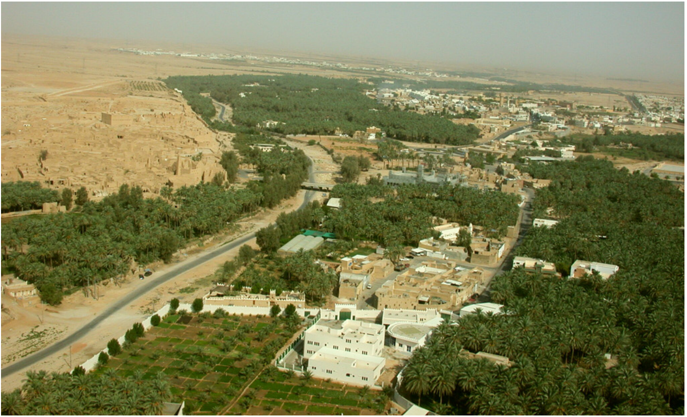
Aerial view of the Wadi Hanifa, 2009.