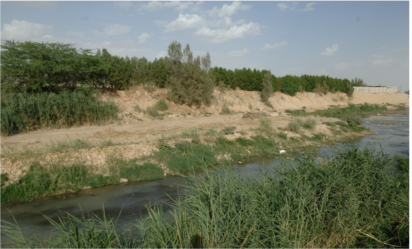
Before the implementation of the Wadi.

The flood performance of the channel is improved by reprofiling and regrading.