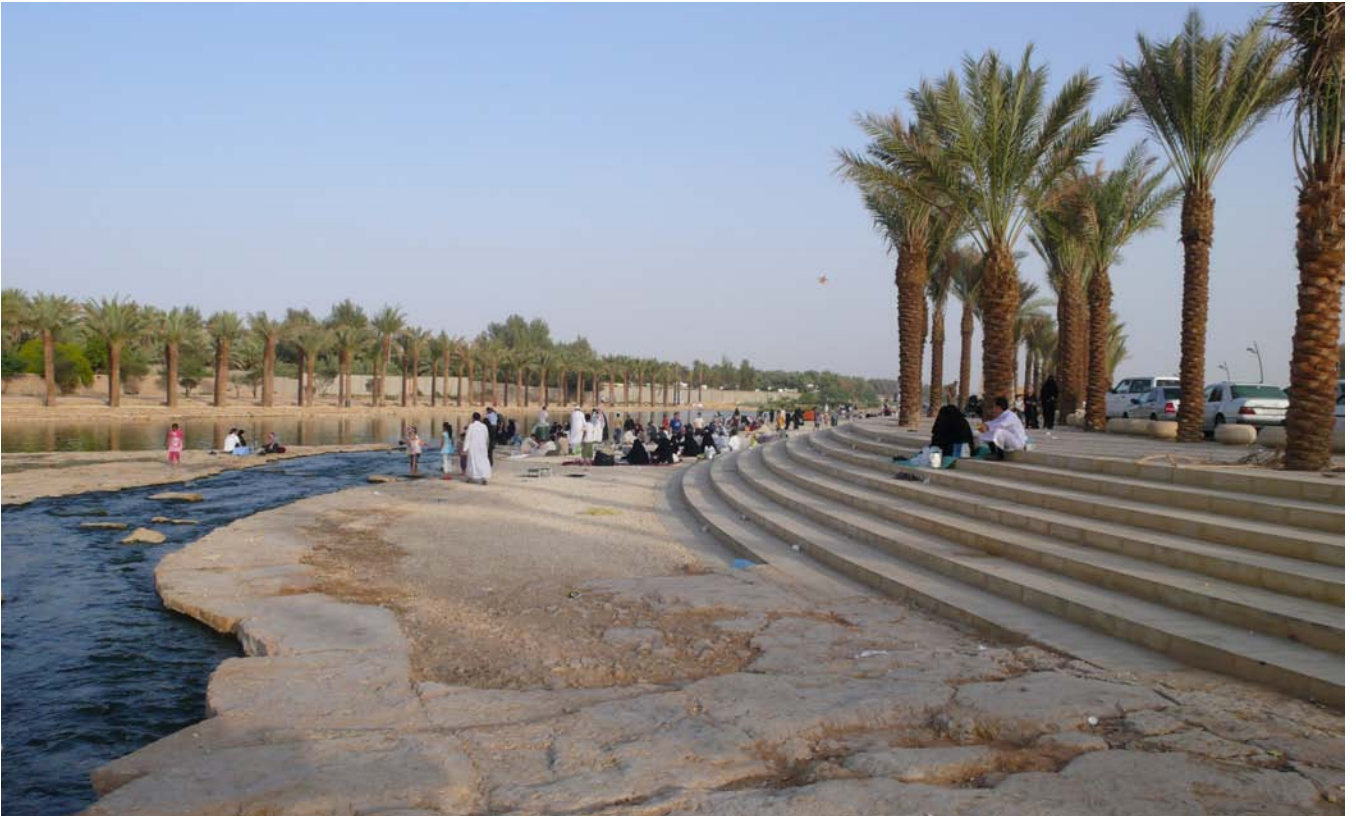
Picnic area along the Wadi.